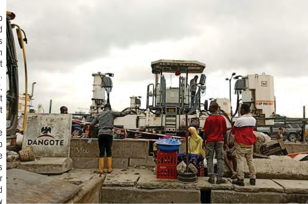
Hi-tech construction company workers on duty

He appealed to the Dangote Construction Company to expedite action as to the development of the road as they intend to execute their duties on time to avoid affecting commuters' daily activities in the area.