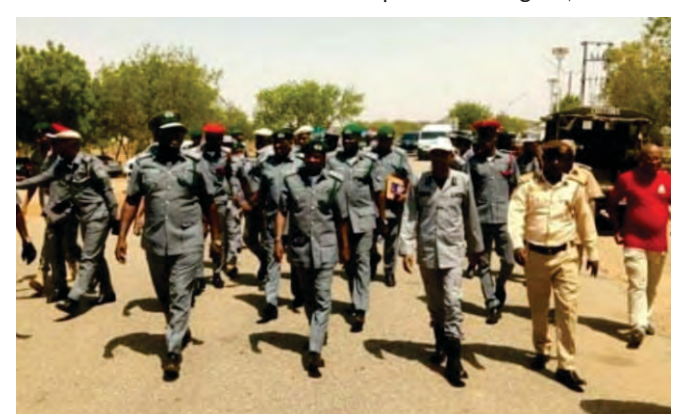
Nigeria Customs Officials

"Items exported include steel bars, agricultural and mineral products amongst others. The Federal Government policy and export incentive schemes have played vital roles in boosting export trade in Nigeria," he said.