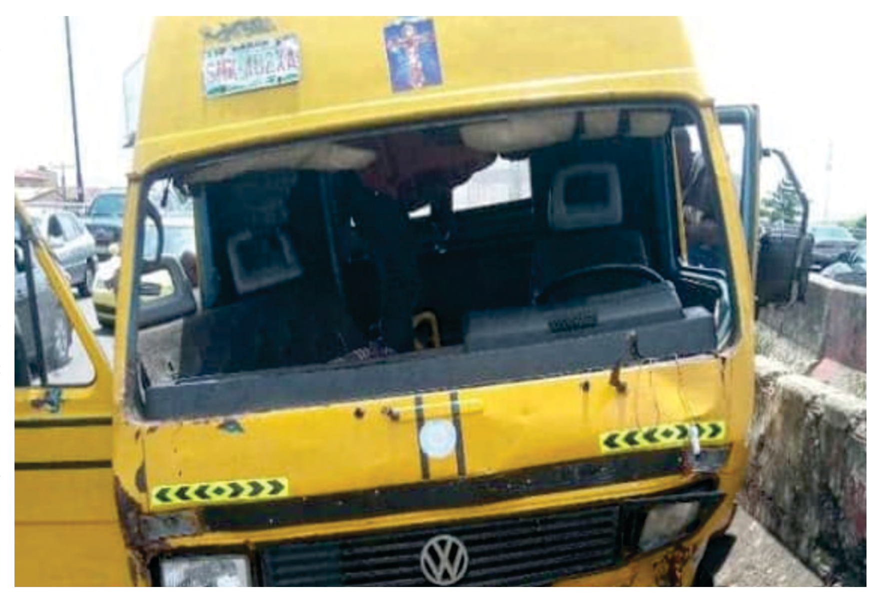
The affected bus