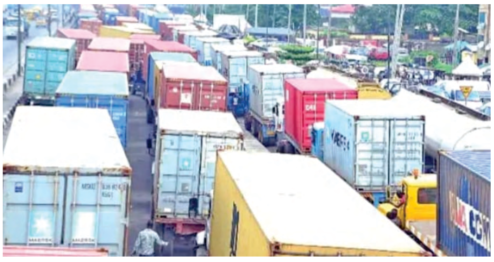
Trucks on Lagos Road

"The myriad of illegal checkpoints on Apapa and Tin Can Island Ports roads in Lagos have become a